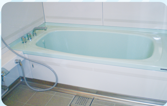
▲23-year-old Enamel Bathtub (finished with acrylic polymer)